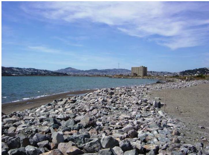
Shoreline at Metal Debris Reef