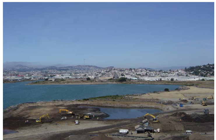
IR-02 and PCB Hot Spot Area