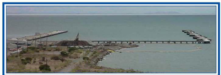
Metal Reef Area - Parcel E