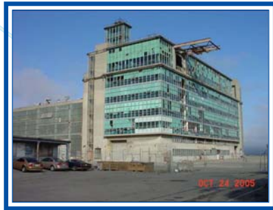
Building 253 - Parcel C