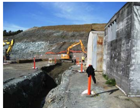
Backfilling in Parcel B