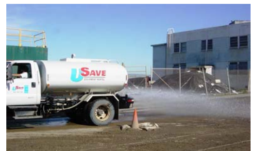
Water truck performing dust control