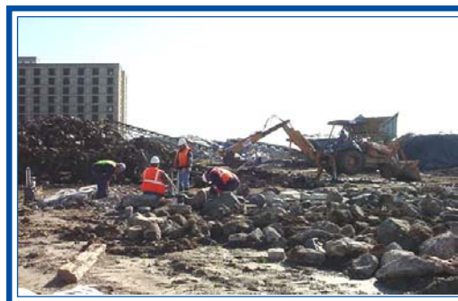
Performing RAD Release Surveys of Concrete Debris