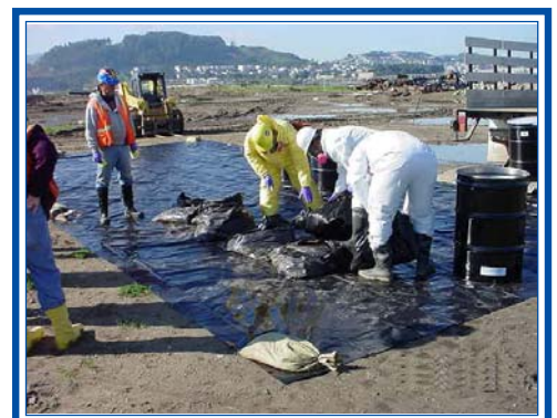
Preparation of collected wastes for radiological screening