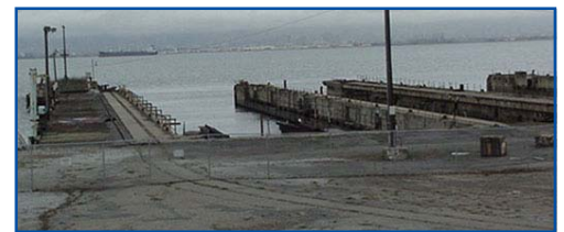
Dry Docks 5 and 7