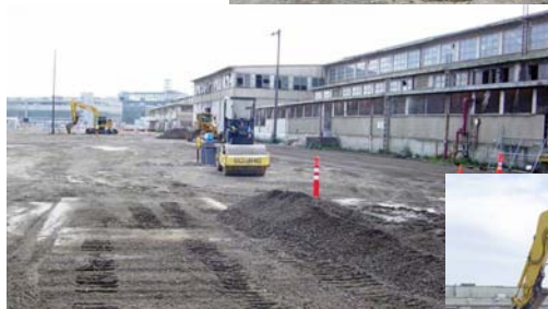
Backfilling Trenches in Parcel B