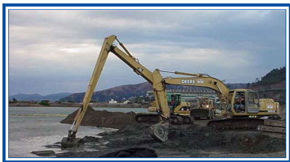
Excavation Activities at Metal Slag Area