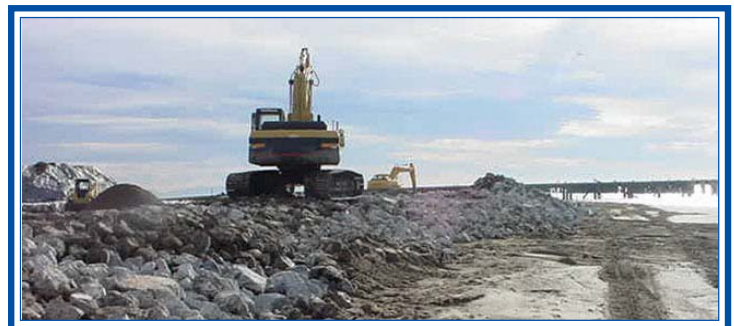
Initial Armor Rock Placement at Metal Debris Reef Area