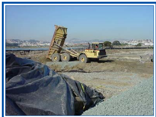
Backfilling Portions of the PCB Hot Spot Area