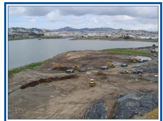
IR-02 Northwest and Central Excavation Area