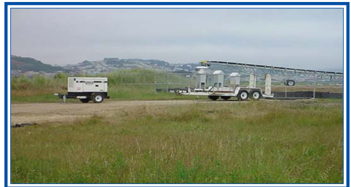
Air sampling equipment in place at IR-02