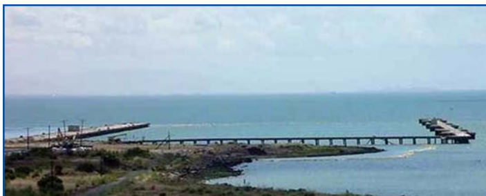
Silt Curtain Installation Complete