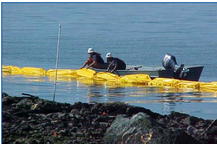
Silt Curtain Installation at Metal Debris Reef