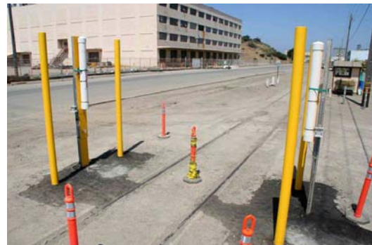
Portal Monitors at Parcel D