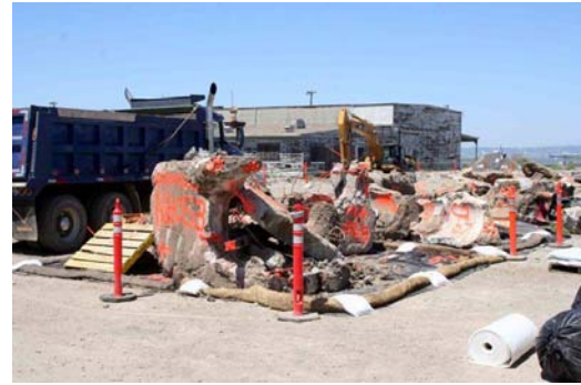
Concrete Encased Pipe