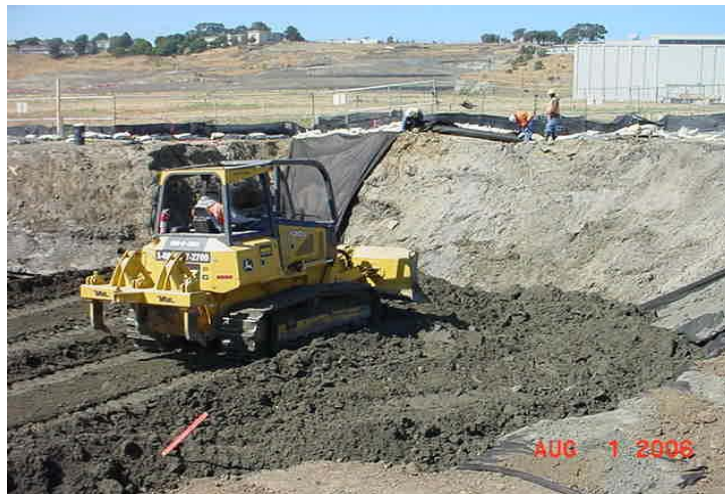
Placement of Backfill at Parcel E-2 PCB Hot Spot