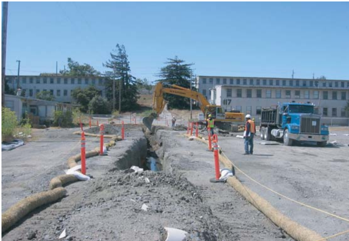
Sanitary Sewer/Stormdrain Line Removals at Parcel B