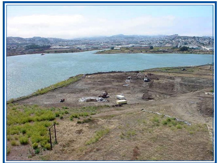
IR-02 During Excavation