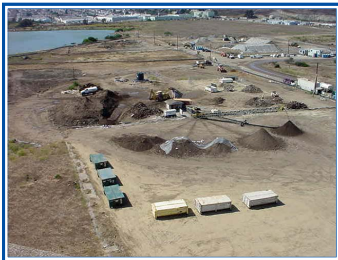
IR-02 During Excavation