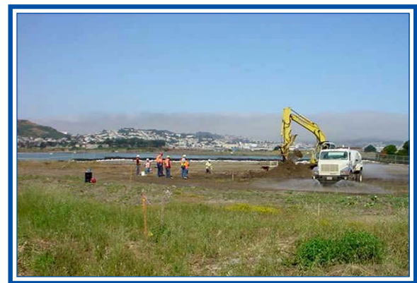
PCB Hot Spot During Initial Excavation