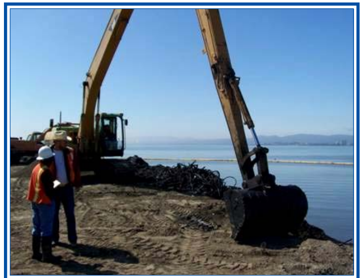
Long Reach Excavator for Offshore Work