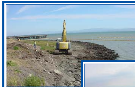
Metal Debris Reef Prior to Excavation (Before)