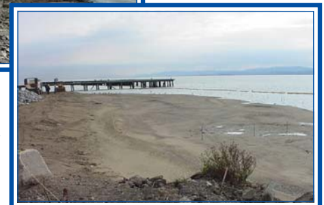
Metal Debris Reef November 2005 (After)