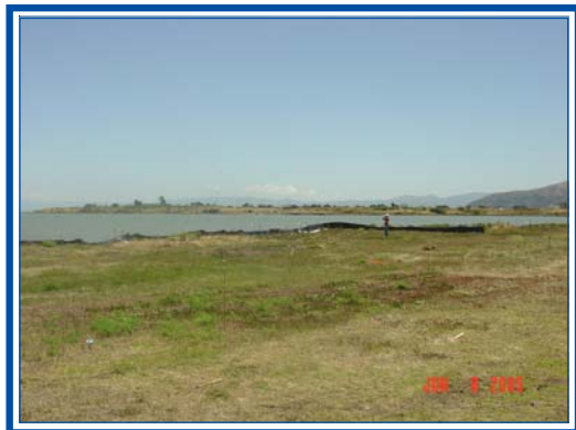
Metal Slag Prior to Excavation (Before)