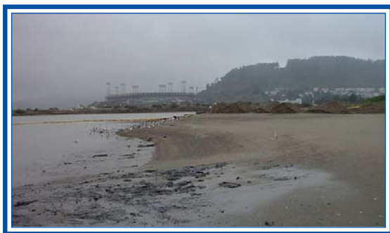
Metal Slag November 2005 (After)