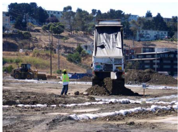
Transferring Soil to the Radiological Screening Yard at Parcel B