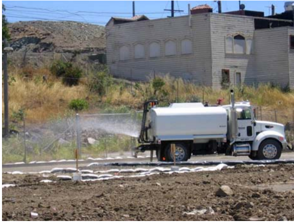
Dust Control During the Parcel B Storm Drain and Sanitary Sewer Line Removal Project