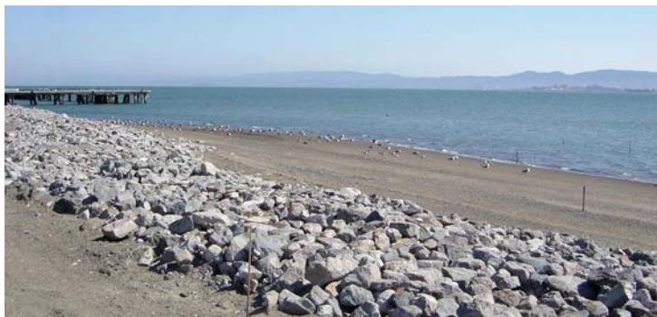
Metal Debris Reef Shoreline