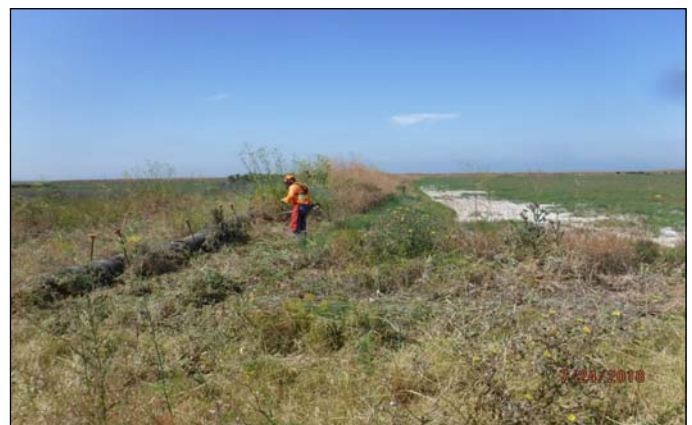
Vegetation clearance at UXO 3—Dredge Pond 3E (hand-held equipment) - July 24, 2018