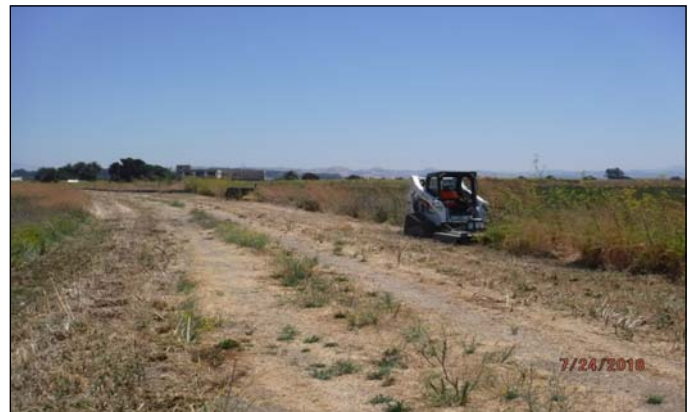
Vegetation clearance at UXO 3—Dredge Pond 3E (skid steer equipment) - July 24, 2018

field work. On July 23, the Navy initiated remedial investigation field work at the UXO 3—Dredge Pond 3E and Northern MCFR site. The field work is a continuation of the remedial investigation that was started in the summer of 2017. The duration of field work is expected to be approximately three months. Remedial investigation field work in July consisted of vegetation clearance activities.