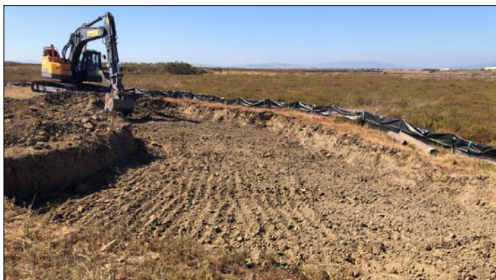
Excavation at SWMU 78 - September 18

The Navy initiated field work on September 10, 2018, at the SWMU 78 debris pile investigation site. The field work consisted of vegetation clearance, wildlife exclusion fence installation, excavation, soil sampling, and transportation of debris and soil off-site for disposal. The SWMU 78 field work will continue through early October 2018.