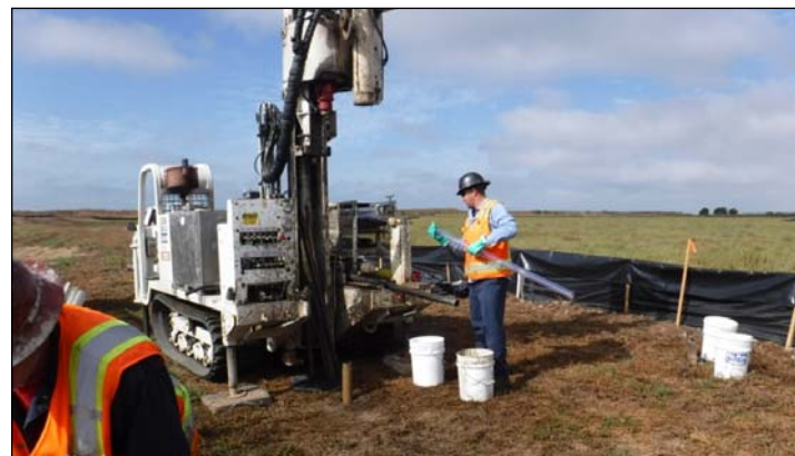
Soil sampling with direct-push drilling rig at Dredge Pond 3E - September 14

The Department of the Navy (Navy) prepared this monthly progress report (MPR) to discuss environmental cleanup at the former Mare Island Naval Shipyard (MINS) in Vallejo, California. This MPR does not discuss cleanup work by the City of Vallejo or its developer, Lennar Mare Island (LMI), through the Navy's Eastern Early Transfer Parcel (EETP) Environmental Services Cooperative Agreement (ESCA). The work completed by the city through LMI this month is reported separately. This MPR discusses progress made during the reporting period from August 31, 2018, through September 27, 2018. The information provided in this report includes updates to field work and removal actions, document submittals, the progress of regulatory reviews, issues associated with Navy environmental programs, and Base Realignment and Closure (BRAC) Cleanup Team (BCT) and Restoration Advisory Board (RAB) meetings.