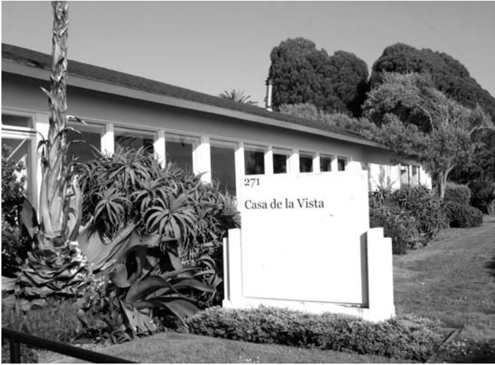
RAB and Public Meeting Location

See the Navy's website at www.bracpmo.navy.mil/bracbases/california/treasure_island for a recent fact sheet about the history of the TI Housing Area.